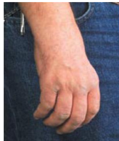
Hand contractures can occur late in the course of CMT.