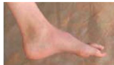
Foot contractures resulting in high-arched feet often occur in CMT.

Because CMT causes damage to sensory axons, most people with CMT have a decreased sensitivity to heat, touch and pain in the feet and lower legs.