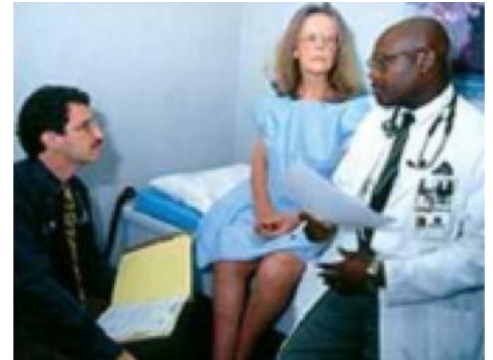
Doctors have many tests for diagnosing CMT.

A positive genetic test result can provide a definite diagnosis and useful information for family planning. But once again, a negative result doesn't rule out CMT.