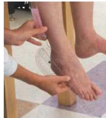
A doctor examines a patient with foot drop.

For example, an occupational therapist might recommend that you put special rubber grips on your home's doors, or buy clothes that fasten with Velcro or snaps. Your neuromuscular clinic can refer you to an occupational therapist.