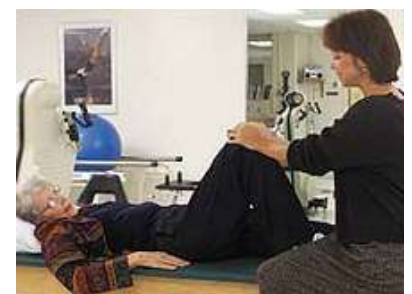
Massage and physical therapy can benefit people with FSHD.