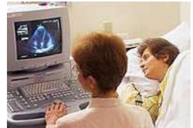
Heart function should be checked in FSHD.

Similarly, breathing difficulties from weakened respiratory muscles aren't common in FSHD, in contrast to their prevalence in some other forms of muscular dystrophy. Testing of pulmonary function at intervals may be recommended for some patients.