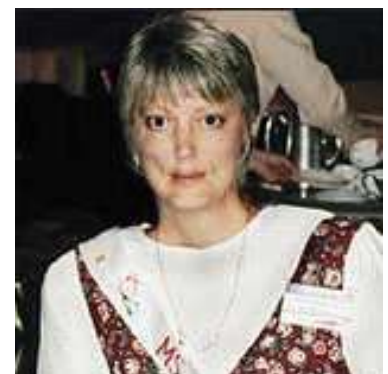
Facial weakness can make it hard to use a straw or even smile.

Of somewhat more concern is the weakness in the eye muscles, which can keep the eyes from closing completely during the night. As the disease progresses, the eyes can sometimes dry out overnight, which can injure them. Waking up in the morning with gritty, burning or dry eyes may be a sign that eye closure isn't complete. Wearing an eye shield or patching the eyes during sleep may be necessary.