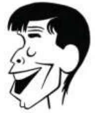
JERRY LEWIS International Patron