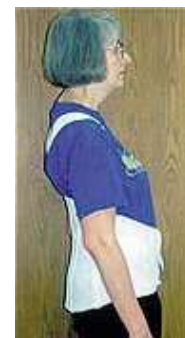
A corset-style back support worn under clothes can help keep the shoulders and lower back in better alignment.