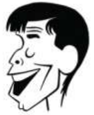
JERRY LEWIS International Patron