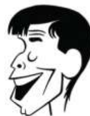
JERRY LEWIS International Patron