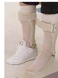
Lower leg braces keep feet from flopping down and tripping the person trying to walk.