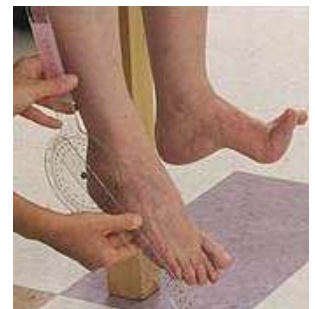
This woman can barely pull back her right foot because of FSHD.